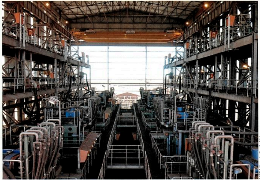
MBE Minerals South Africa

P O Box 526 Modderfontein 1645 Tel: +27 (11) 457-1600 (0861 966 323) Fax: +27 (11) 608-1016 email : info@woodbeam.co.za