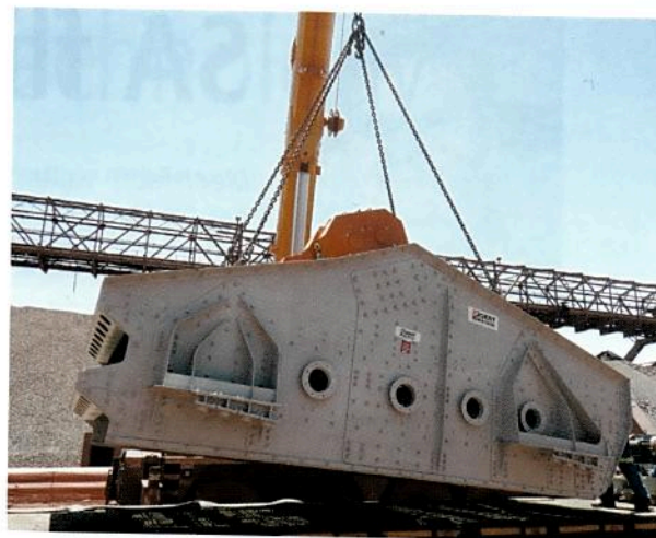
A Joest Kwatani double deck screen ready for installation at a washing and screening plant of the Kathu-based iron ore mine.

The screens were manufactured at the company's premises in Kempton Park, Gauteng. Depending on the installation schedule at the mine, four to eight units